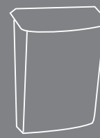
A4 [PORTRAIT] Code: A4EXT